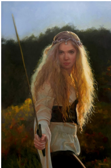
2025 Best of Show winner: Lately I've Been Dressing for Revenge by Laurie Maddalina